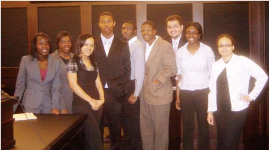
Community High School Mock Trial Championship Team

The Foundation is pleased to report its continuing partnership with the Richmond Commonwealth Attorney's Office in the administration of three high school programs designed to encourage and redirect at-risk youth: a Mock Trial Championship Team, a Youth Court, and an Urban Debate League. The mock trial team recently earned two individual awards at a regional competition, one for best overall attorney and one for best overall witness. The team itself was very competitive, winning one of the four rounds of the competition and coming within a few points of the leaders in two other rounds. We look forward to providing our supporters with exciting updates on the progress of all three programs as we assist the Commonwealth Attorney's Office in its goal to expand them to all city high schools.